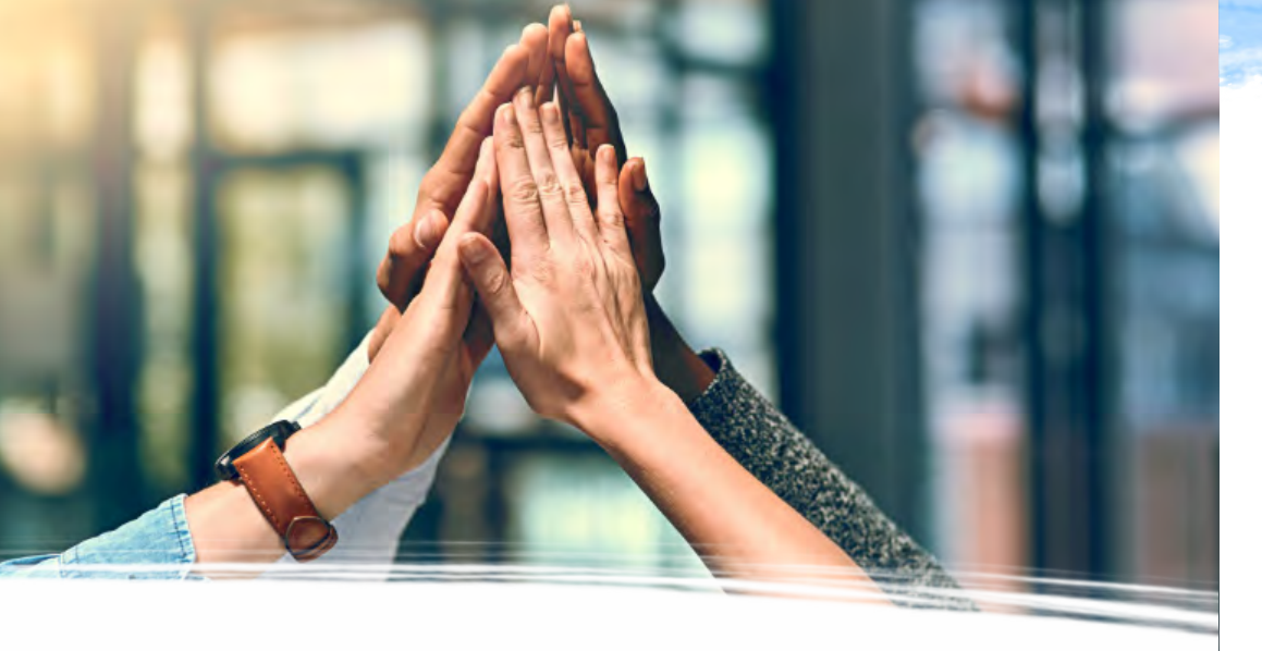
Working Groups were formed to initiate two collective projects